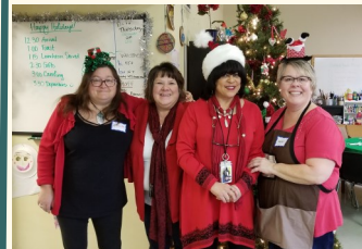
Holiday events at David's Harp!