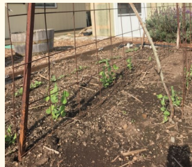
Peas and radishes growing in the community garden