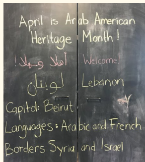
Entryway chalkboard at the Cultural Gathering.